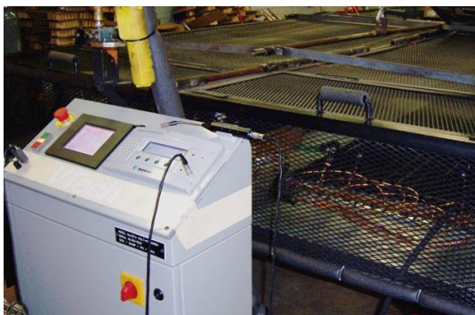
VTech 75 Multifunction Leak Detection System

Many coil manufacturers are in fact still using underwater testing to detect leaks in their coils. This method has many disadvantages, such as being highly operator dependent, time consuming and scarcely accurate. A large drying oven must also be used to remove the excess water. The VTech 75 machine eliminates these steps and automates the process, first by testing for gross leaks using a pressure decay test and then, if the