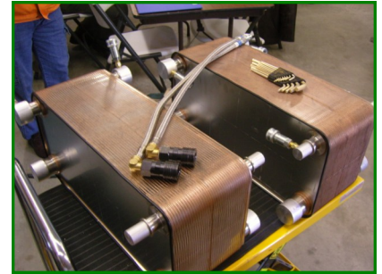
Large Heat Exchangers to be tested

Our Technical who supervised the installation, says "Compared to inside-out helium leak testing, also known as vacuum chamber