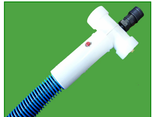
VTech's light and compact Refrigerant filling head

switching to R410a will need to replace their existing charging equipment. VTech makes that easy with a high pressure filling head capable of charging all other common HFC refrigerants. Also, the machine has all of the refrigerant temperature and pressure data stored in its program logic. You've done all the design work necessary for the switch, so there's no need to worry about anything else. Basically, that means we're ready when you're ready. Contact us today for more details.